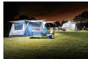
Back-up power / UPS