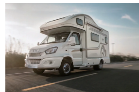
Motorhome / RV