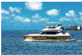
Marine / boats